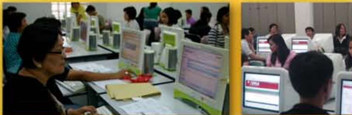
Hundreds have participated in our training run by a team of specialists in educational technologies.

For requests or announcements on upcoming training, call or email us.